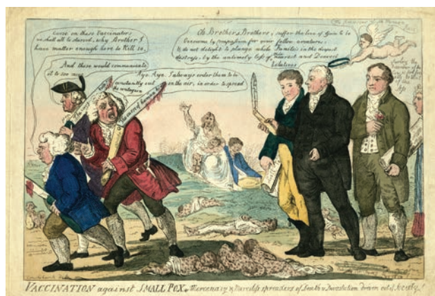
Figure 32-1. George Cruikshank, Vaccination against Small Pox or Mercenary and Merciless spreaders of Death and Devastation driven out of Society! London, England: SW Fores, 1808. General George Washington was strongly criticized in the press because of the risks and his decision to go ahead with forced variolation despite concerns. A political cartoon, published in the 1800s, shows how critically forced variolation was seen by the public despite the Army’s intent to benefit its soldiers.

Surgeon General George Sternberg, who had been trained as a bacteriologist at Johns Hopkins Medical School, appointed Major Walter Reed, another Johns Hopkins medical trainee, to the Yellow Fever Commission in 1900. Reed used “informed consent” statements when he recruited volunteer subjects from among soldiers and civilians during the occupation of Cuba at the end of the Spanish-American War, and those statements could be considered “personal service contracts” (Figure 32-2). These documents clearly communicated the risks and benefits of participation, described the purpose of the study, provided a general timeline for participation, and stated that compensation and