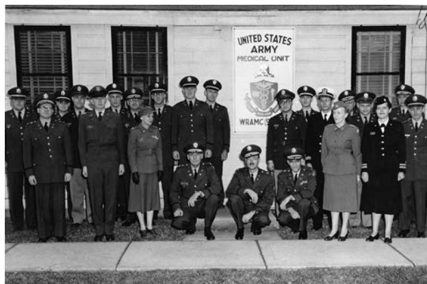
Figure 32-4. The US Army Medical Unit at Fort Detrick, under Colonel William Tigertt (center) was staffed with personnel drawn from the US Army, Navy, Air Force, and Public Health Service, whose assignment was given the highest national priority because of their unique expertise in infectious disease medical care, research, and epidemiology, and because of their determination to provide the Operation Whitecoat volunteers the best care and support for their safety during the trials. Photograph taken in 1957.

conduct of the study, this multistage informed consent process ensured that participation was voluntary. Soldiers were told that their participation in the research was not compulsory. Approximately 20% of those soldiers approached for participation in Operation Whitecoat declined. Review of Operation Whitecoat records of interviews with many of the volunteers and investigators revealed that the researchers informed